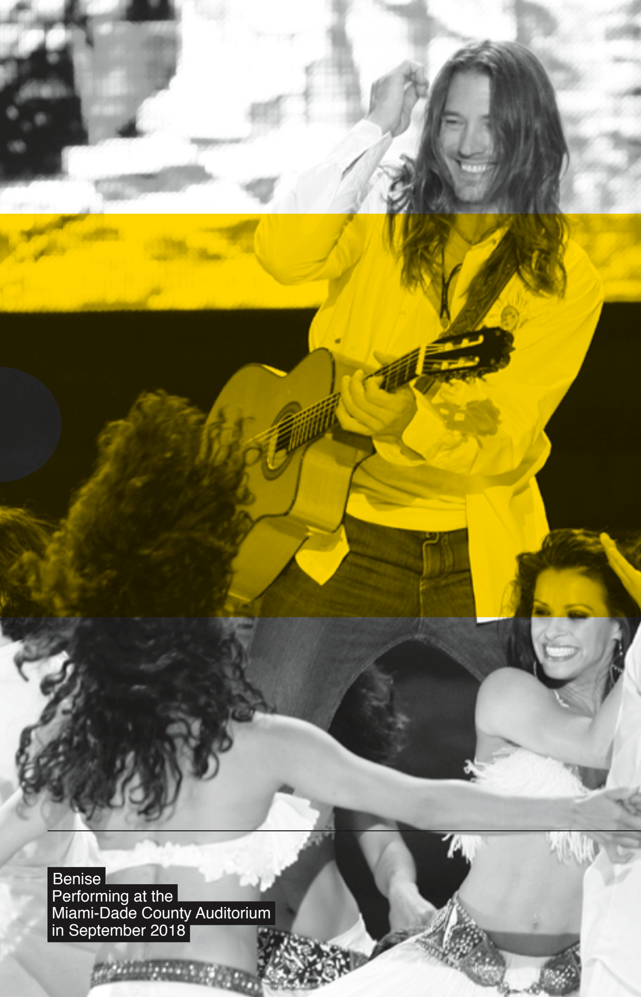
Benise Performing at the Miami-Dade County Auditorium in September 2018