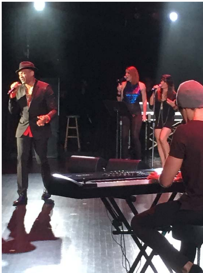
December Bueno performance (March 13, 2015)