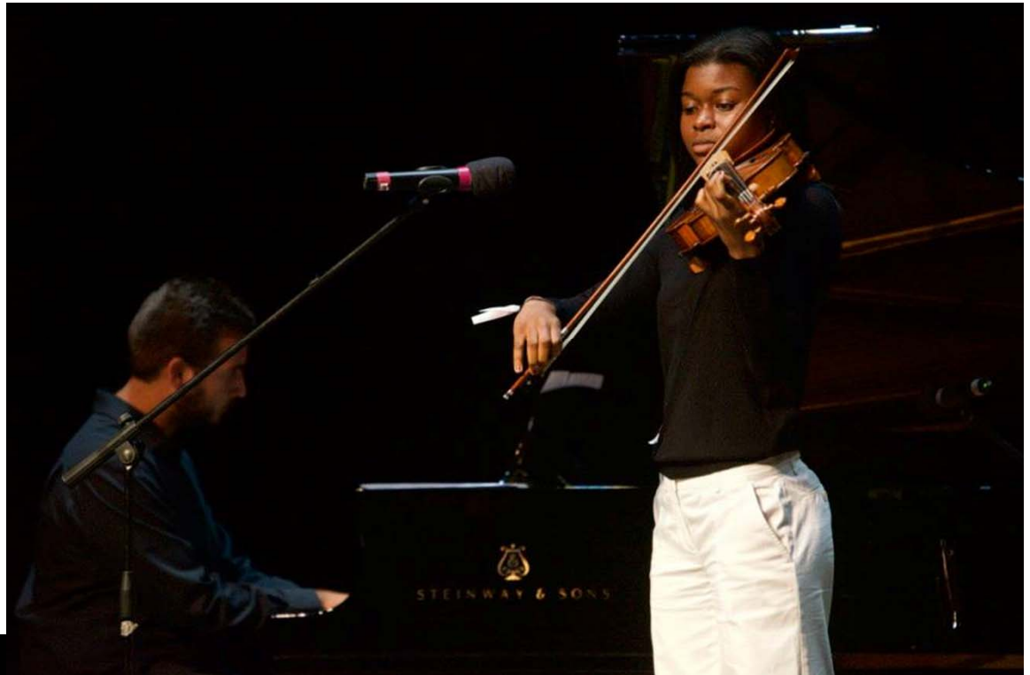
Auditions for Actor's Playhouse' Young Talent Big Dreams (March 15)