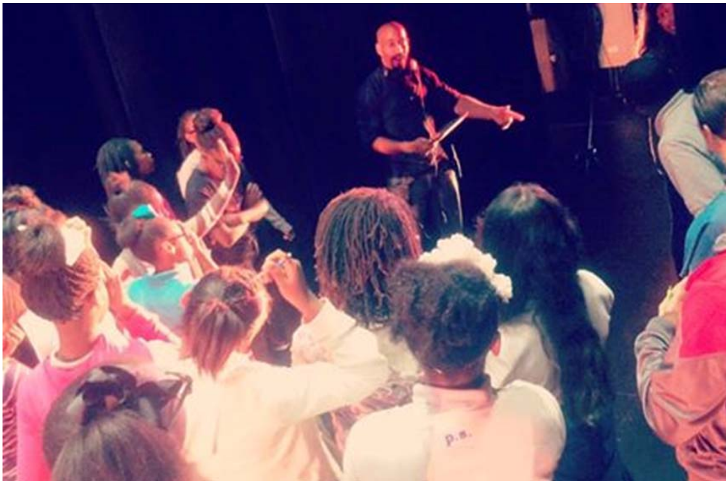
Theater Etiquette Workshop for Mays Conservatory (March 16 and 19)