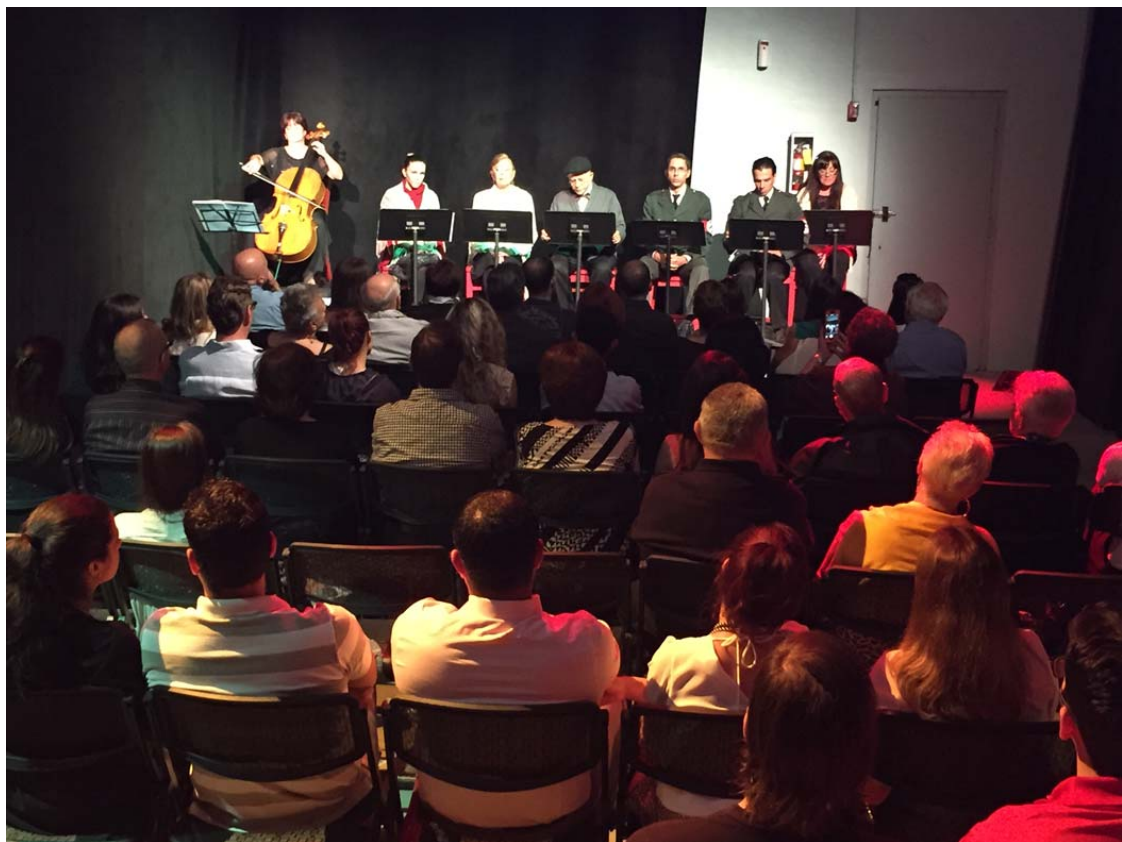
Reading of Musica para Hitler , part of the Open Theatre reading series (March 20, 2015)