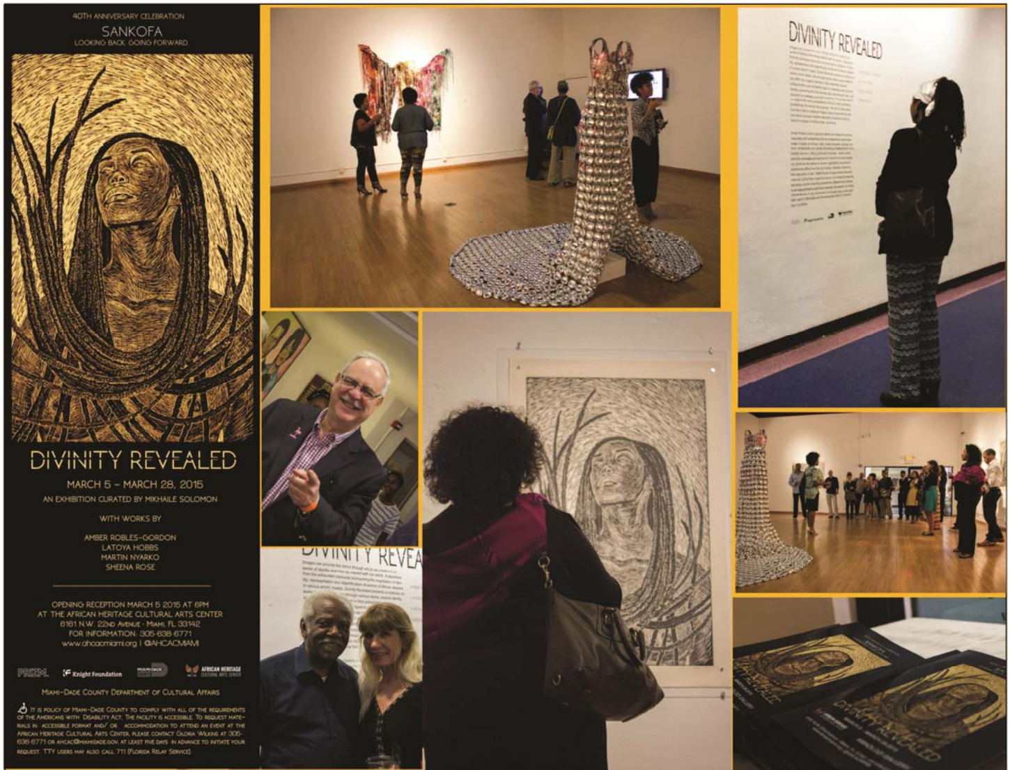
Opening reception for Divinity Revealed at the Amadlozi Gallery.