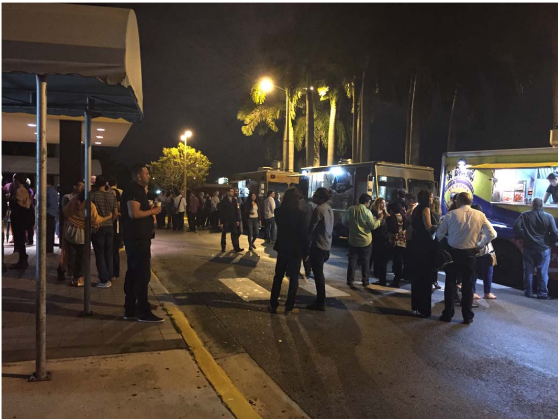
Food trucks were part of Global Cuban Fest 2015 (March 7, 2015)