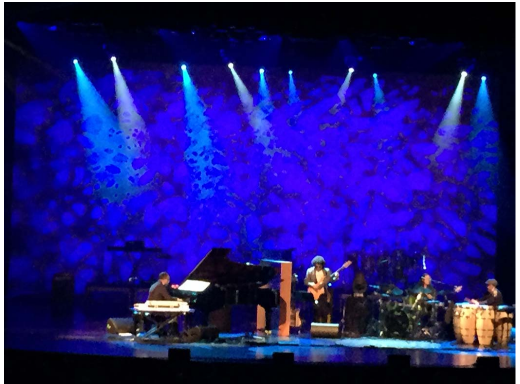
Gonzalo Rubalcaba's performance during Global Cuban Fest 2015 (March 7, 2015)