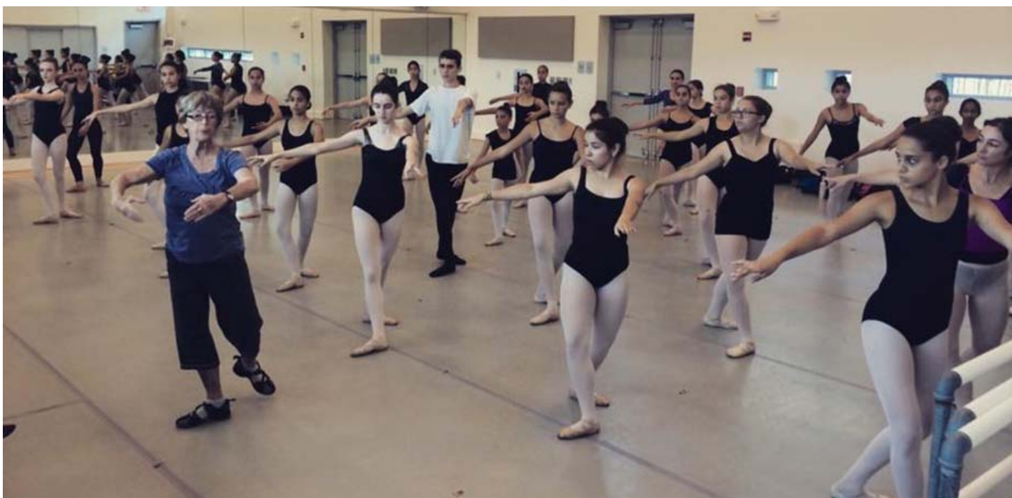
Ballet Memphis Community Outreach Class (April 25)