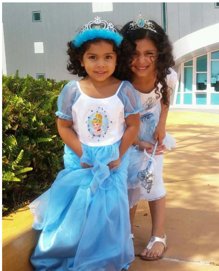
Young patrons attending Cinderella (April 18)