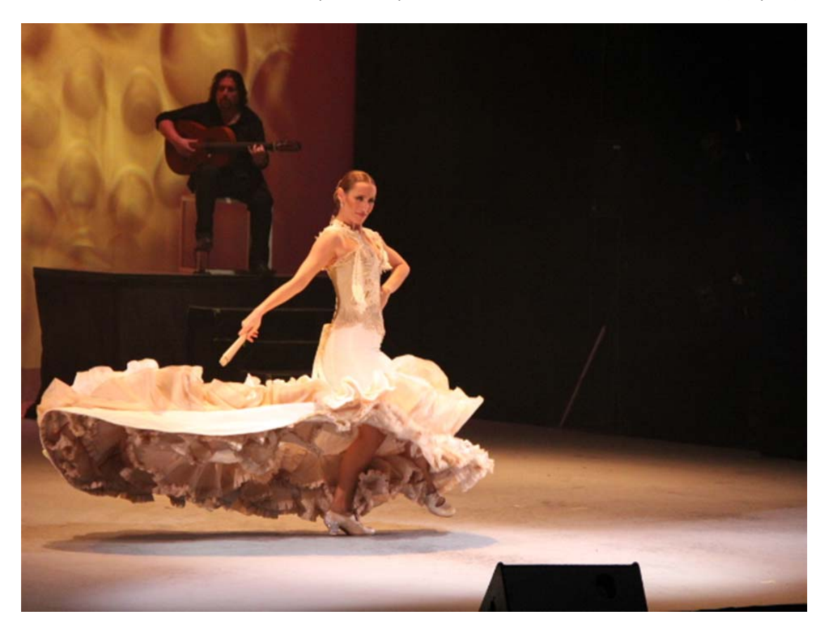
The US premiere of Siudy's Flamenco Intimo featuring Farruquito (May 30)