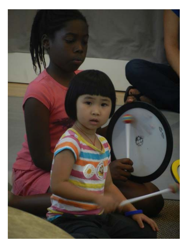
All Kids Included Family Festival (May 2)