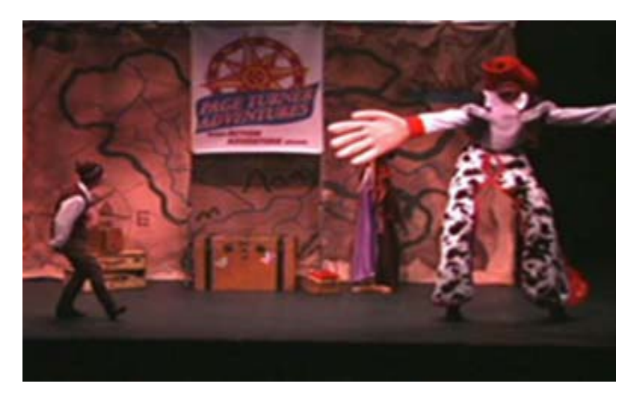
Page Turner's Adventures - Mixed-up Fairy Tale (May 8)