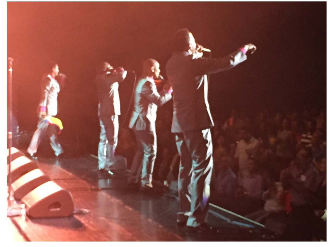
Grupo Niche performed in front of a sold-out house (May 16)