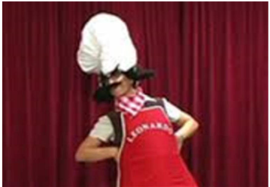
Page Turner Adventures' The Great Pizza Contest (June 12)