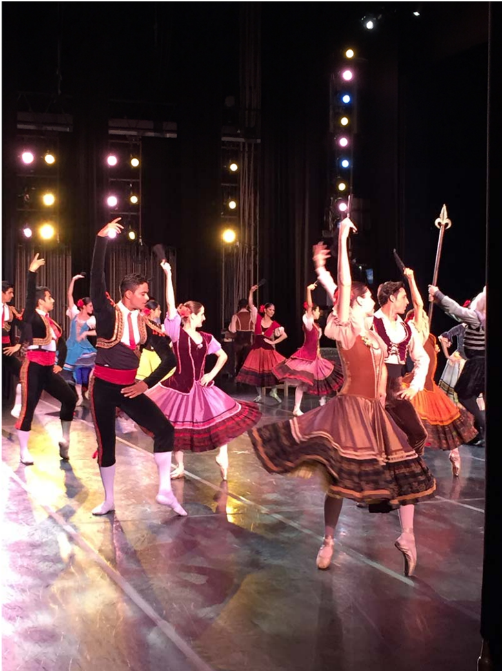
Cuban Classical Ballet performed the Don Quixote suite (June 21)