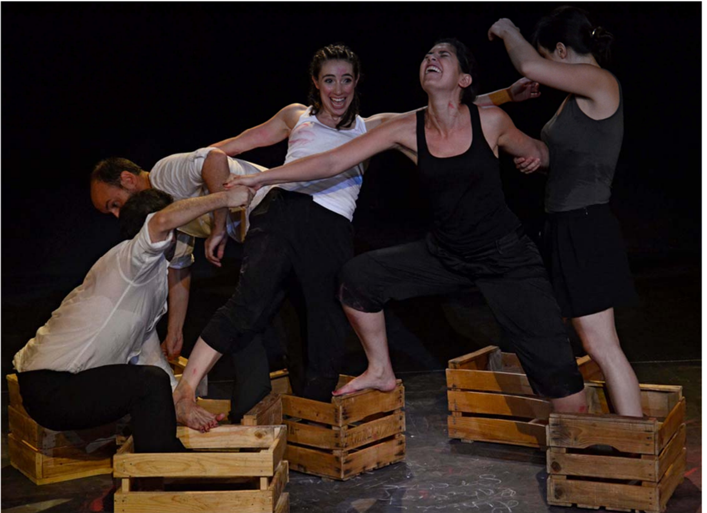
Escriba Su Nombre Aqui , part of the 30 IHTF presented on the On.Stage Black Box (July 24-25)