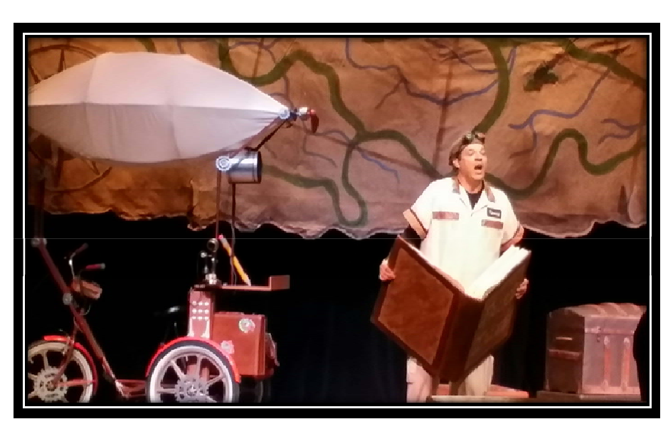
Mixed Up Fairytales Page Turner Adventures