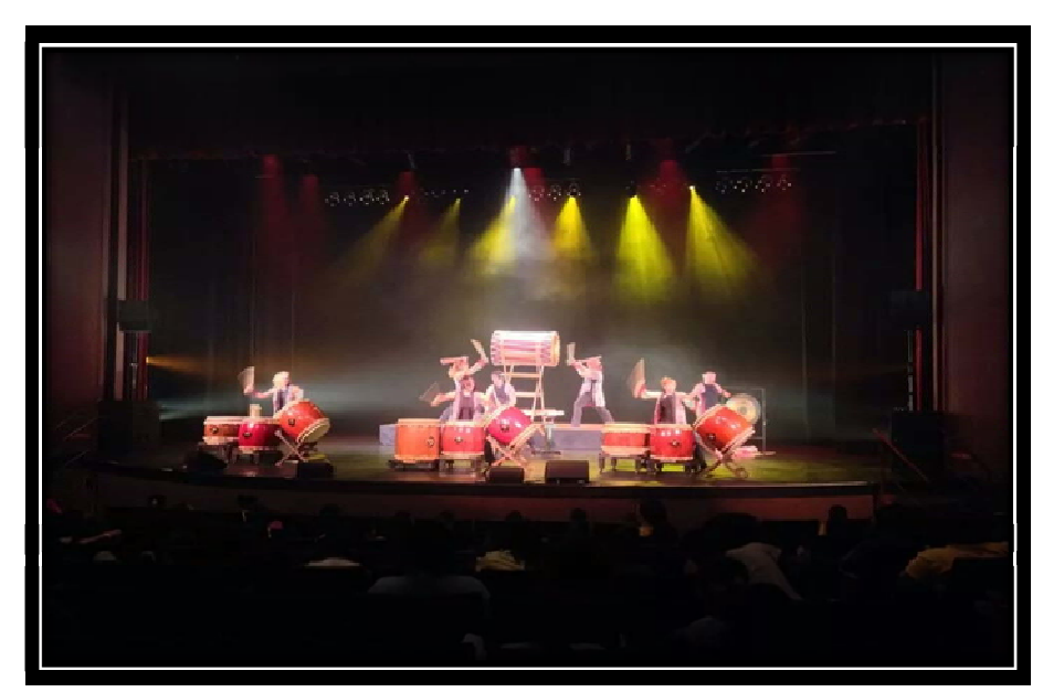
Fushu Daiko Japanese Taiko Drummers