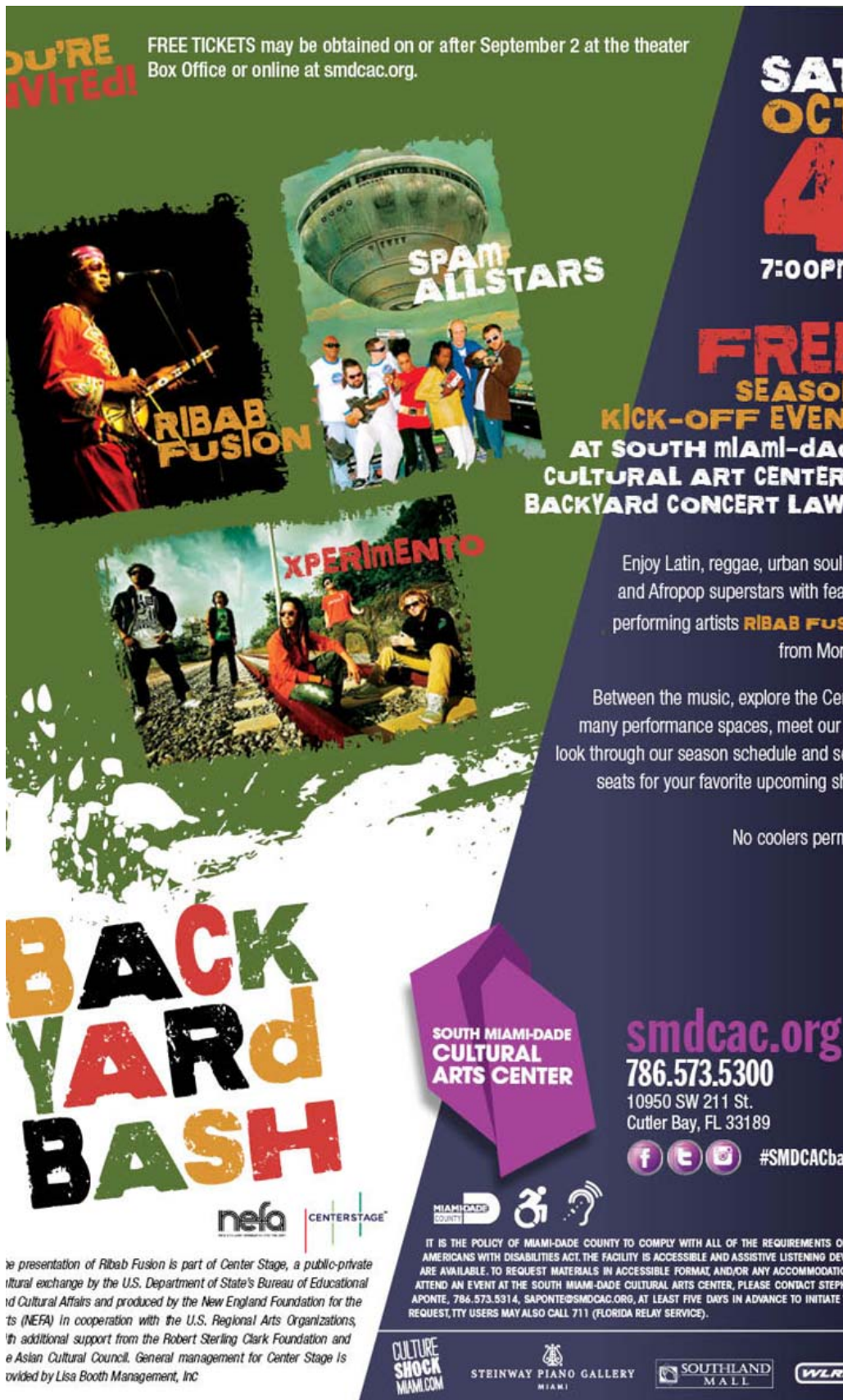
Backyard Bash Promotional Flyer/Eblast