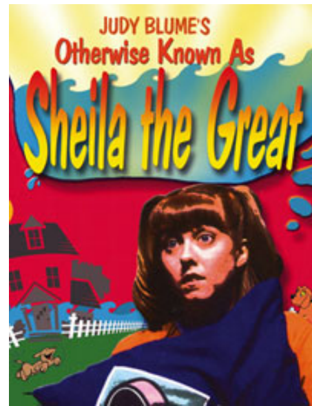
Otherwise Known as Sheila the Great (October 20)