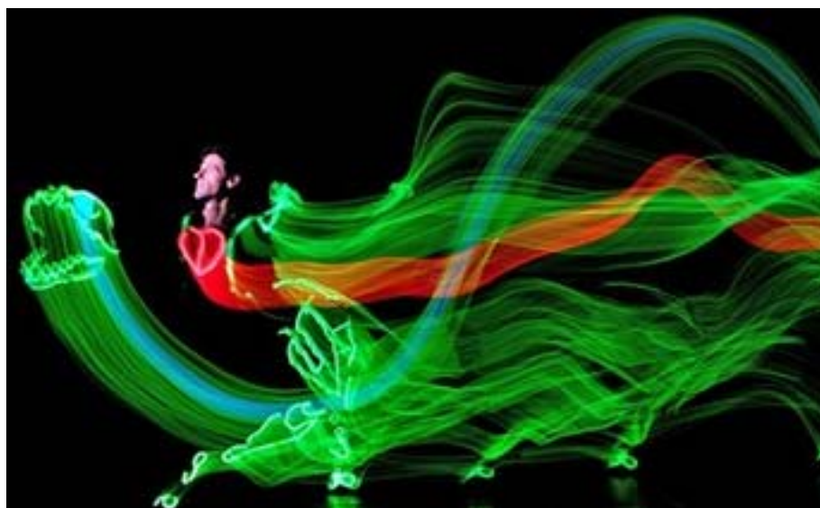
Lightwire Theatre's DiNO-Light (October 22-23)