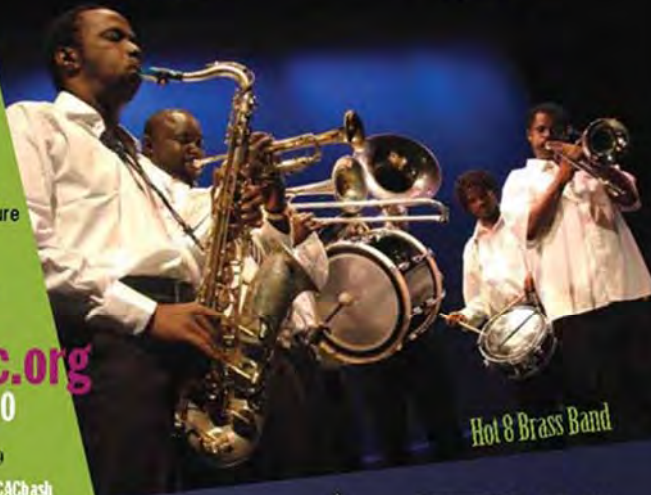
Hot 8 Brass Band