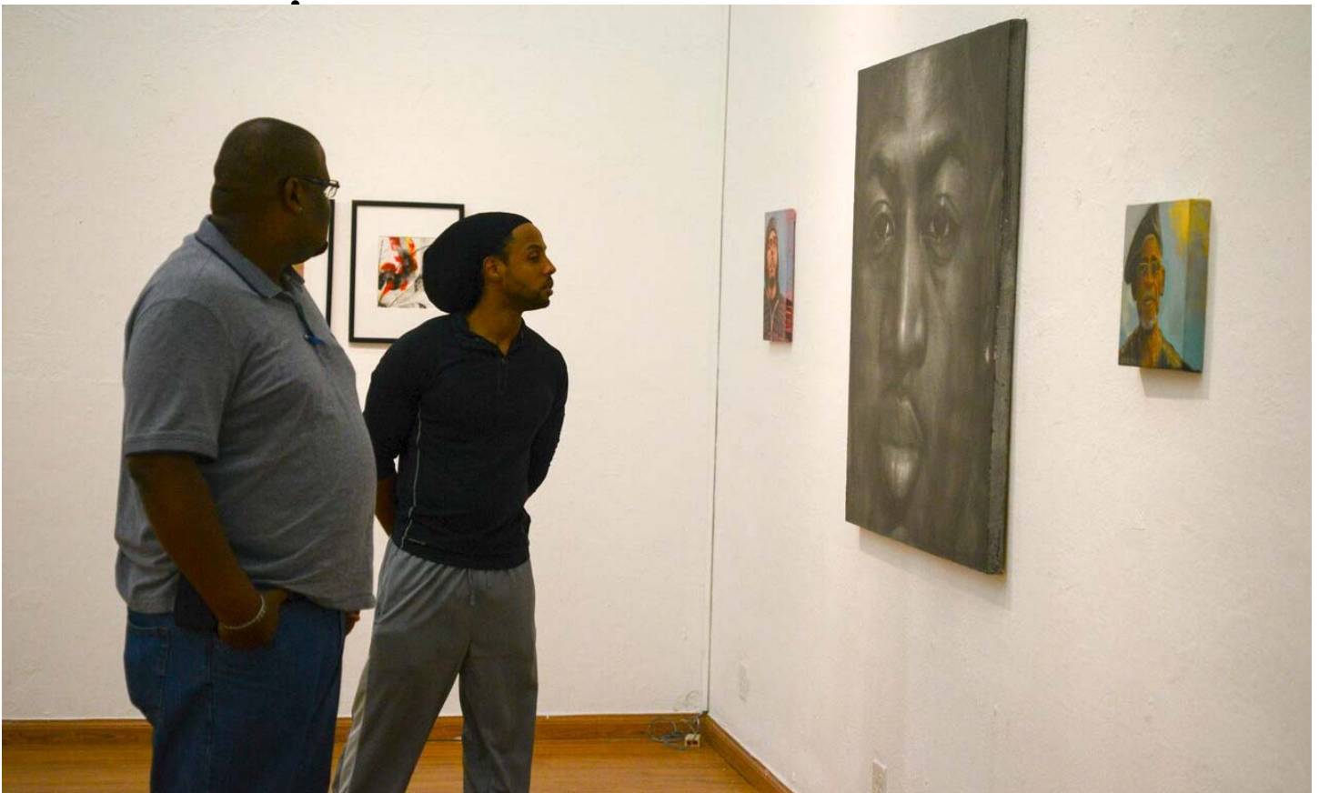
Gallery show featuring images from the play Hustle