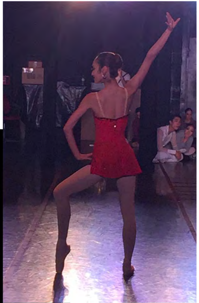
A dancer from the Korean Ballet Company during the International Ballet Festival of Miami (September 13)