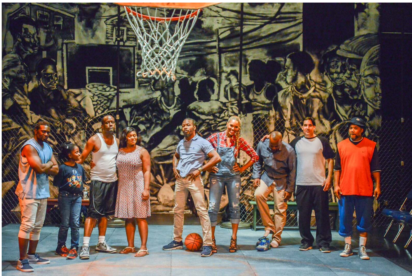
Scenes from the play Hustle