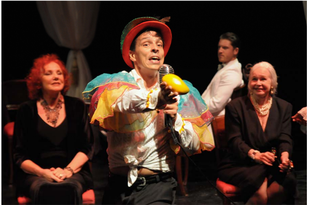
El Color del Deseo , written and directed by Pulitzer Prize-winner Nilo Cruz (November 5, 6, 7, 12, 13, and 15)