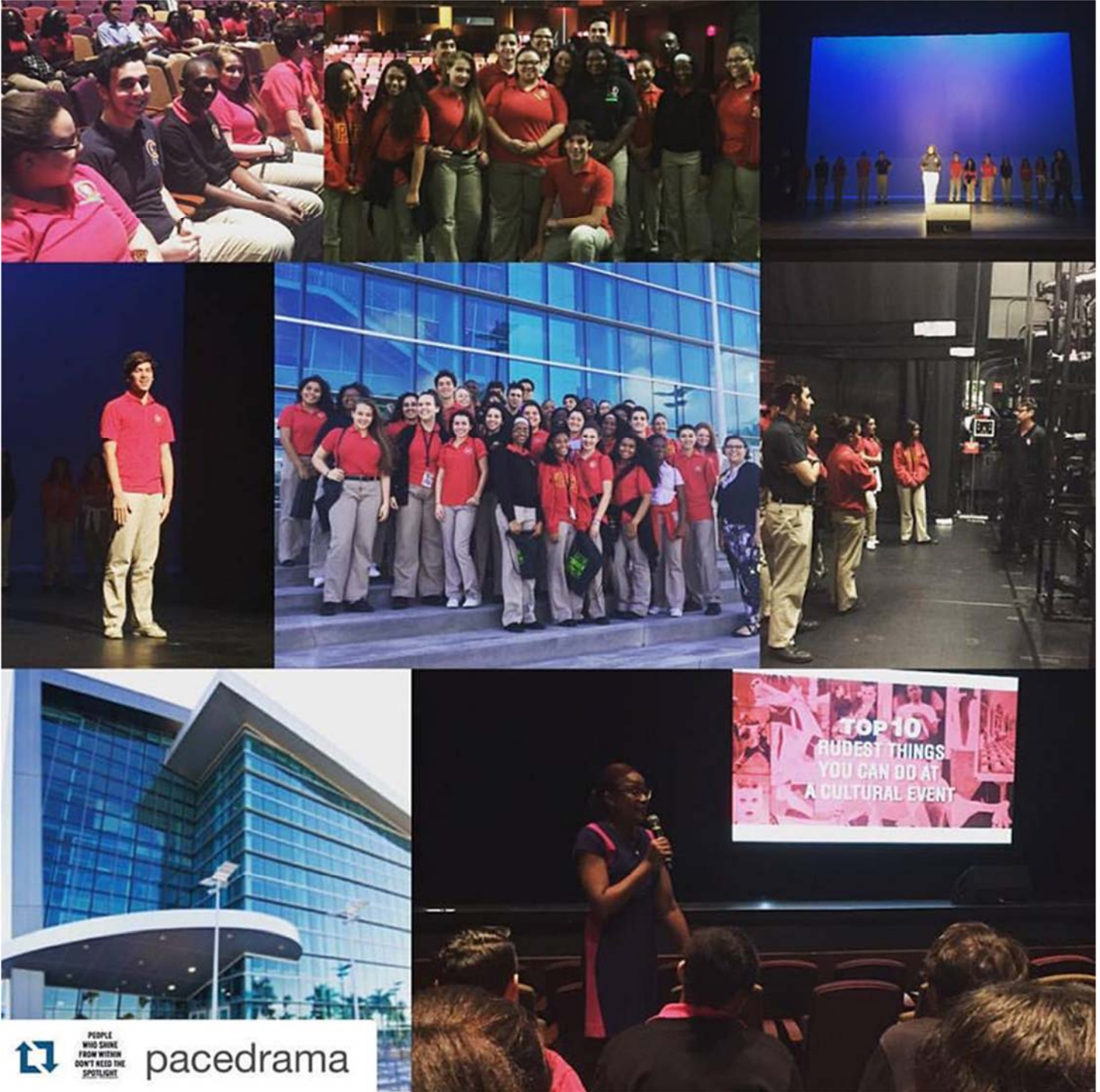
Theater Etiquette Course For Pace High School Students (November 18)