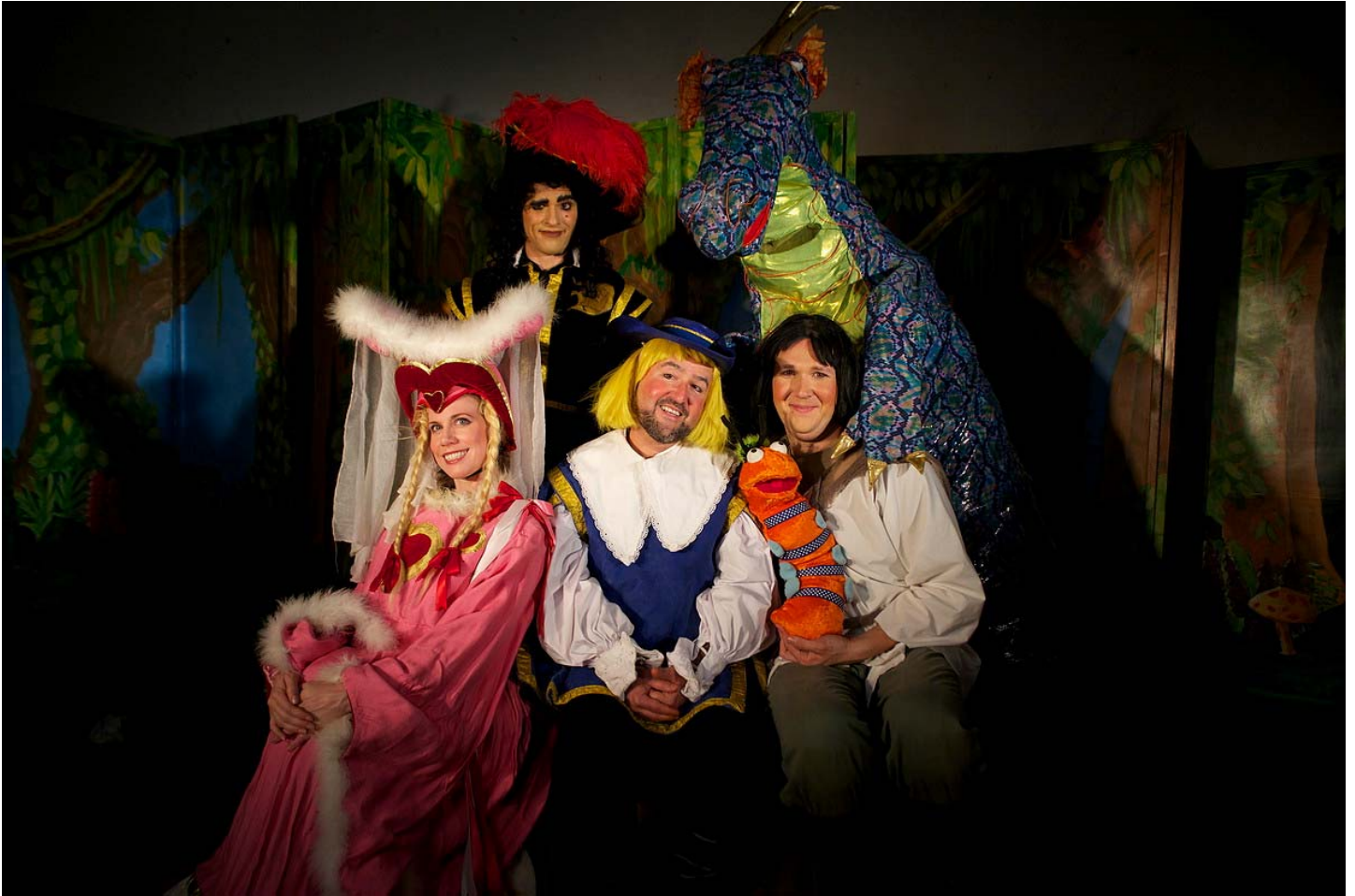
The Three Mess-Keteers (November 30, December 1, and 2)