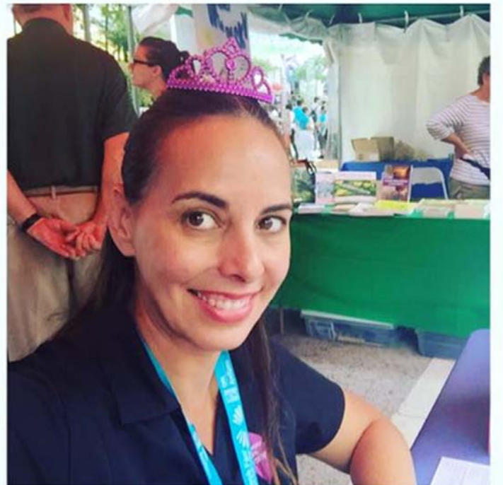
Promoting the Fancy Nancy show at The Miami International Book Fair (November 20-22)