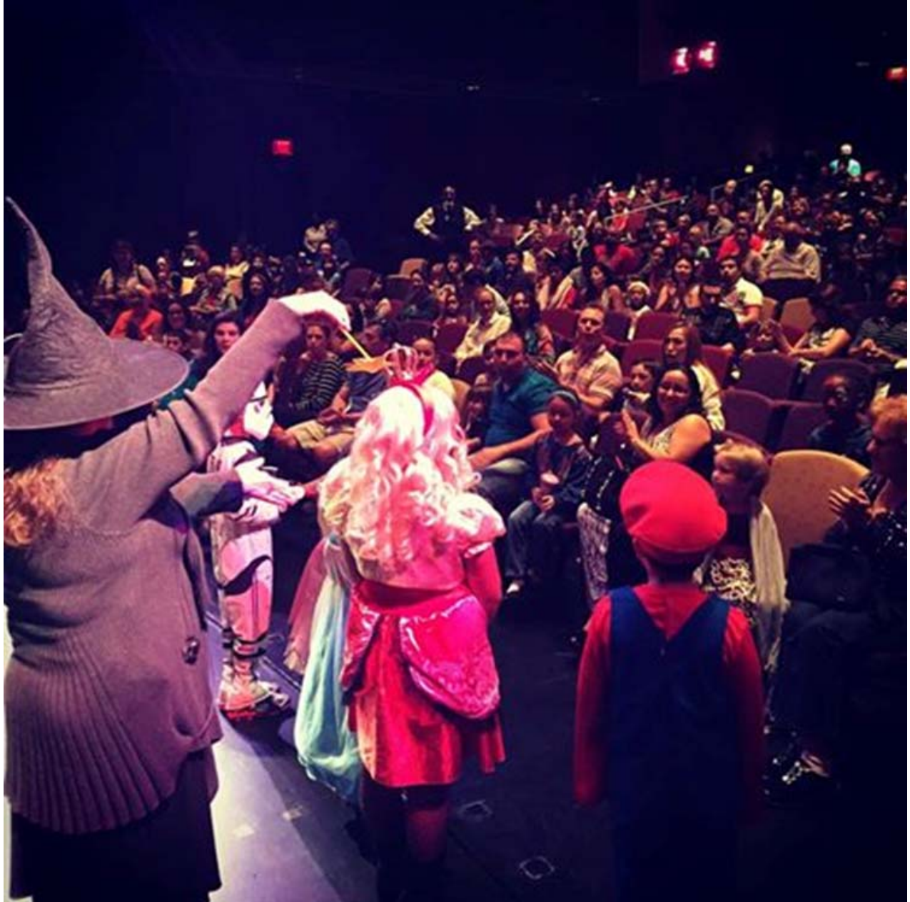
Dino Light Family Show costume contest (October 25)