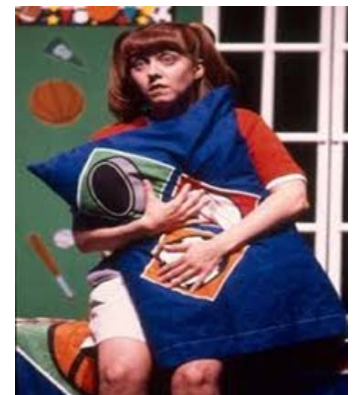
Otherwise Known as Sheila the Great (October 20)