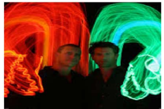
Lightwire Theatre's DiNO-Light (October 22-23)