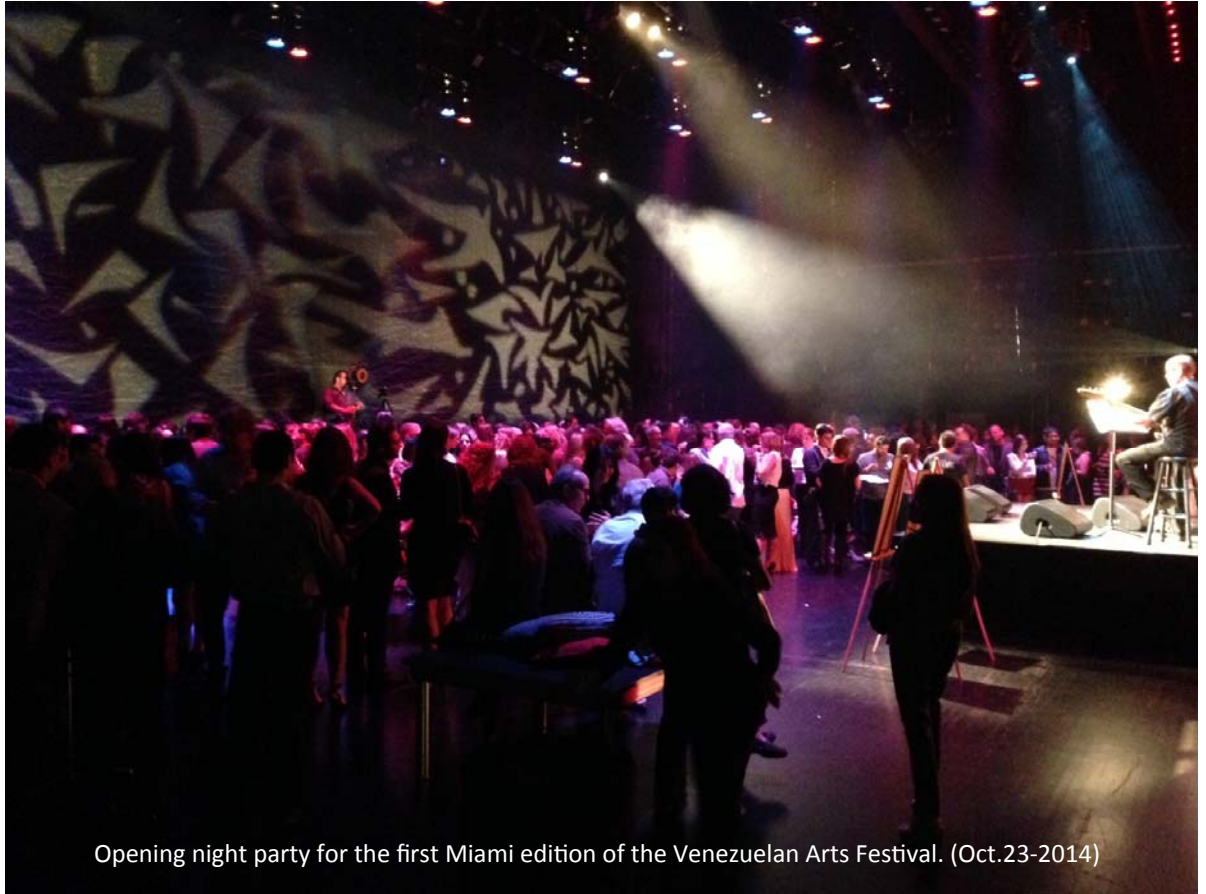
Opening night party for the first Miami edition of the Venezuelan Arts Festival. (Oct.23-2014)