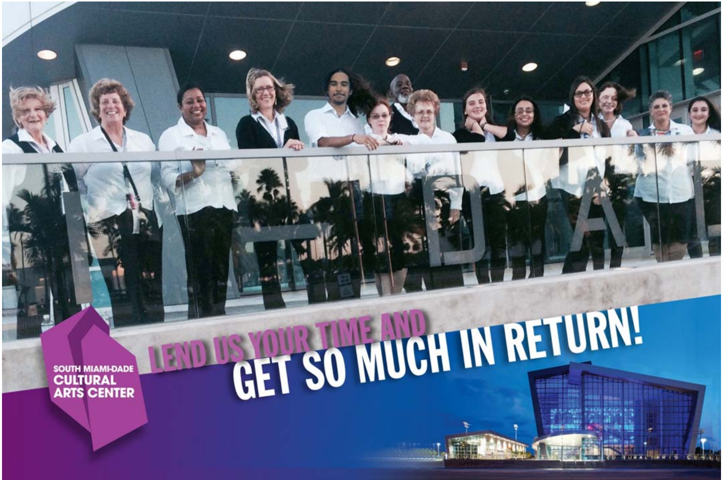
Volunteer recruitment postcard