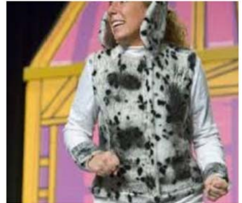
Harry the Dirty Dog (October 15)