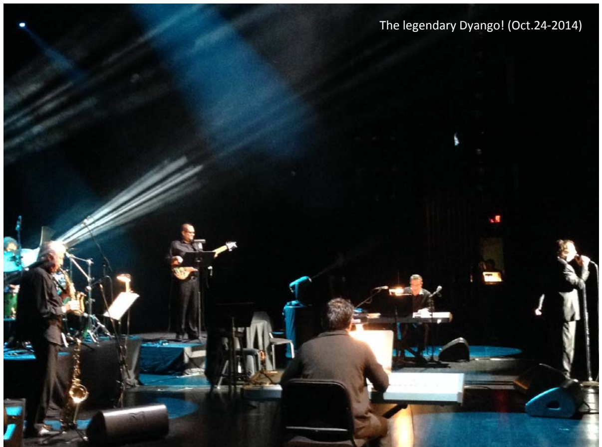
The legendary Dyango! (Oct.24-2014)