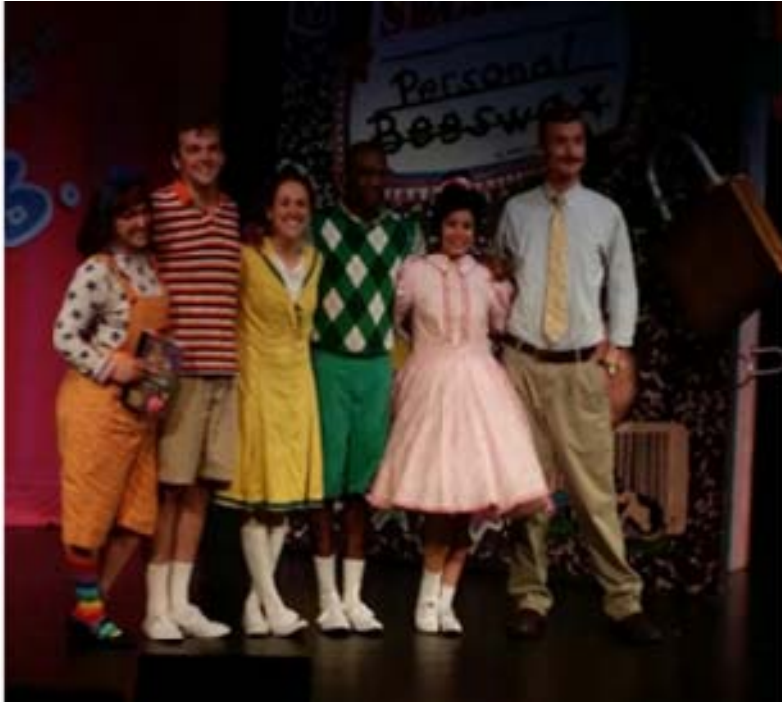
Junie B. Jones (November 5)