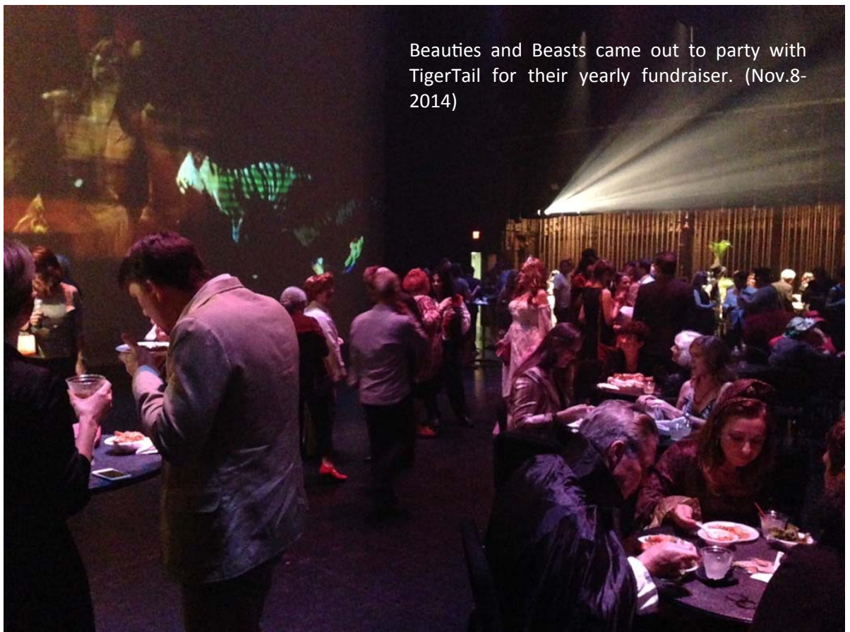
Beauties and Beasts came out to party with TigerTail for their yearly fundraiser. (Nov.8-2014)