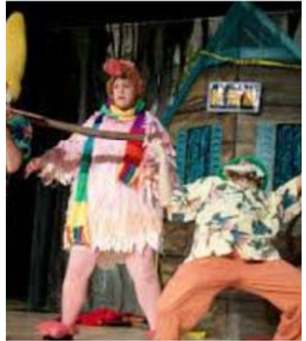
Never Everglades (November 12-14)