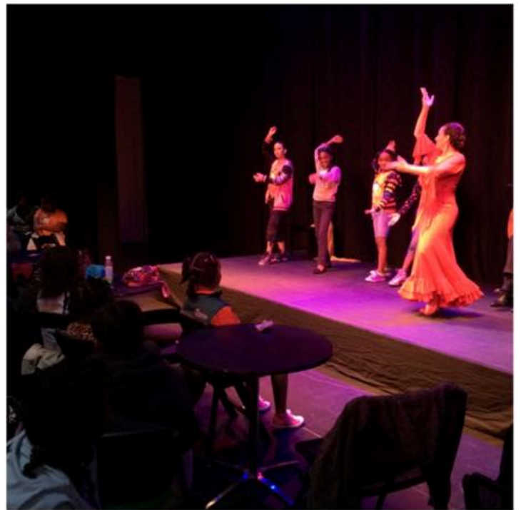
Honey Shine arts day at South Miami-Dade Cultural Arts Center (November 22)