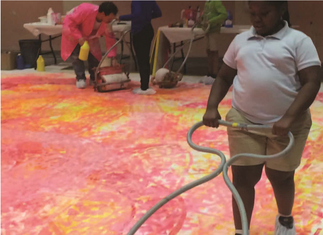
In November, all the students in our aftercare school program had an opportunity to experience the very popular ZOT ARTZ workshop!