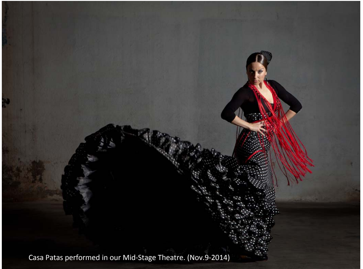
Casa Patas performed in our Mid-Stage Theatre. (Nov.9-2014)