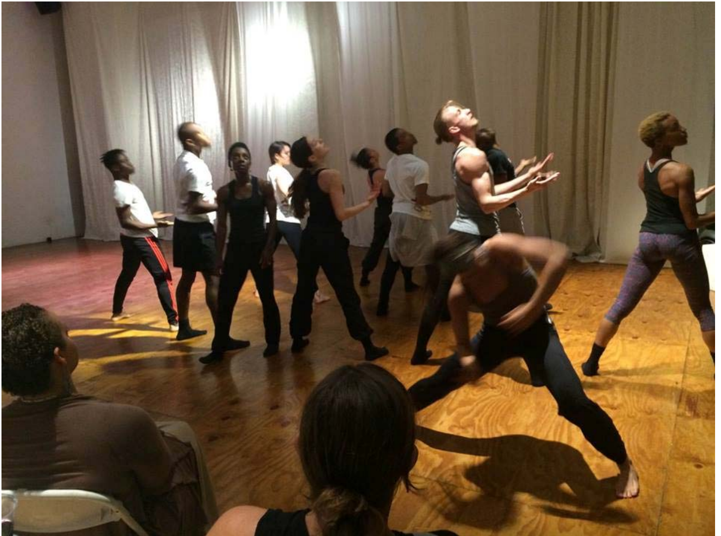
TU Dance demonstration at INKUB8 (November 5)