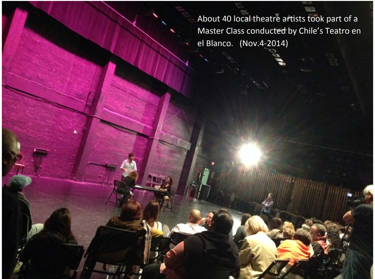
About 40 local theatre artists took part of a Master Class conducted by Chile's Teatro en el Blanco. (Nov.4-2014)