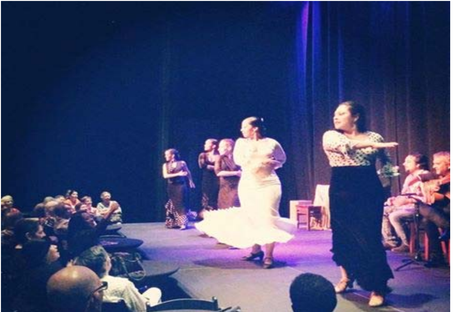
Flamenco demonstration for Senior Citizens (November 14)