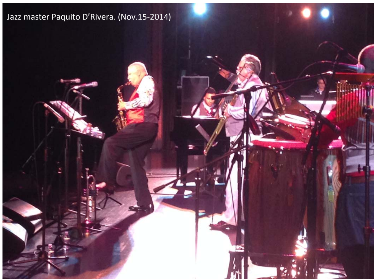
Jazz master Paquito D'Rivera. (Nov.15-2014)